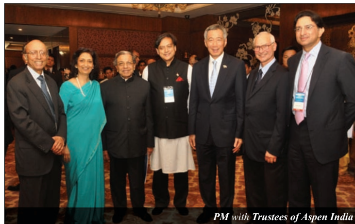
PM with Trustees of Aspen India