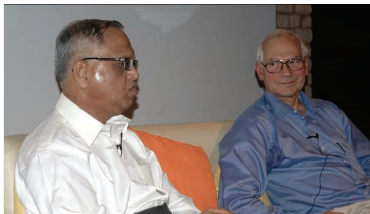
Narayana Murthy and Jamshyd N Godrej on Leaders for Tomorrow