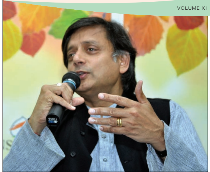
Shashi Tharoor on New Age Indian Diplomacy

A panel discussion on Pax Indica was organized on 27th August in New Delhi. The session