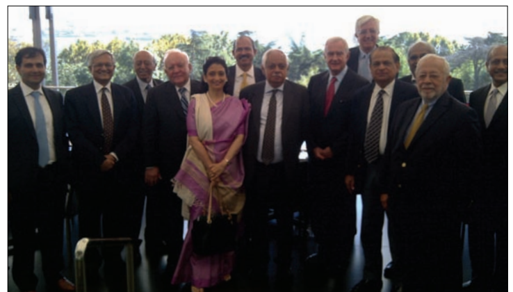
Delegates at the 1st India-Turkey Forum in Istanbul