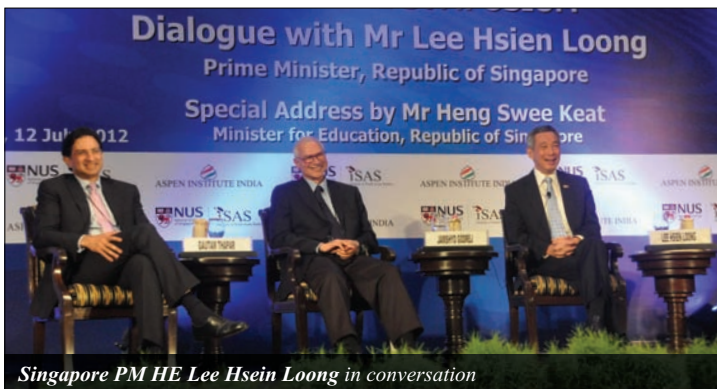
Singapore PM HE Lee Hsein Loong in conversation

Aspen India, for the first time, hosted Prime Minister of any country. Singapore PM, H.E. Mr. Lee Hsien Loong participated in a unique Singapore Symposium jointly organized with Institute of South Asian Studies (ISAS) on July 12.